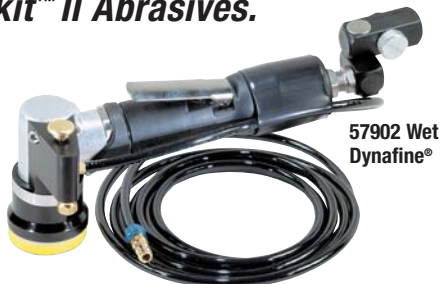
57902 Wet Dynafine®