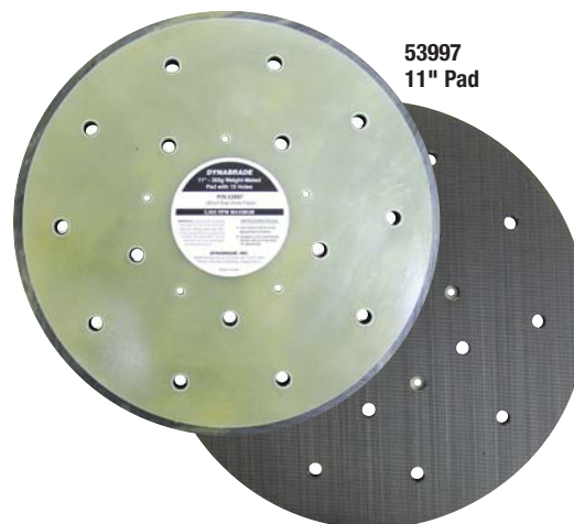
53997 11" Pad