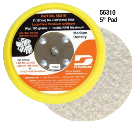
56310 5" Pad