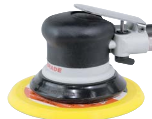
56826 Dynorbital® Supreme

3M, Trizact and Hookit II are registered trademarks of 3M Company.